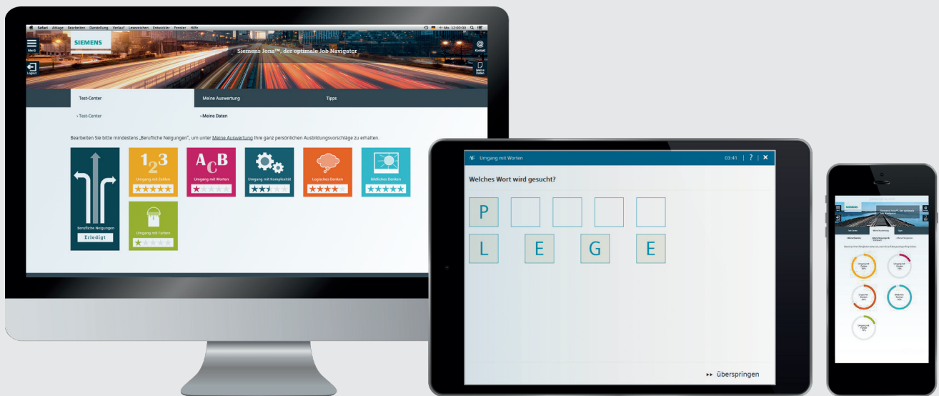
screenshots: career GPS

All the processes offered by cut-e can be integrated seamlessly into your existing application management, assessment or HR systems (e.g. Taleo, SAP-HR, Lumesse EasyCruit, i-GRasp, Talentlink etc.). And, of course, it is all in your corporate look and feel, so applicants have a seamless experience.